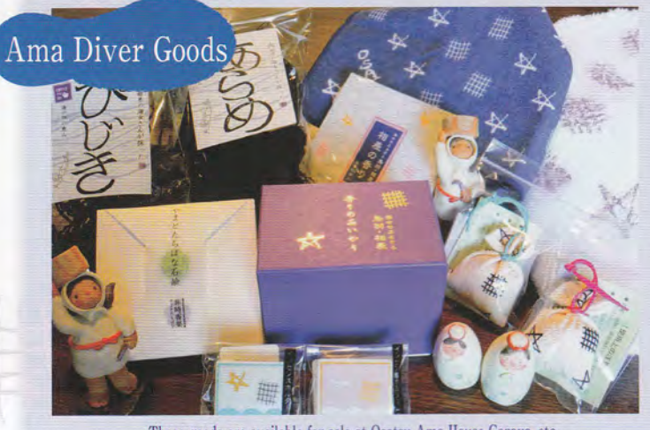
These goods are available for sale at Osatsu Ama House Gozaya, etc.